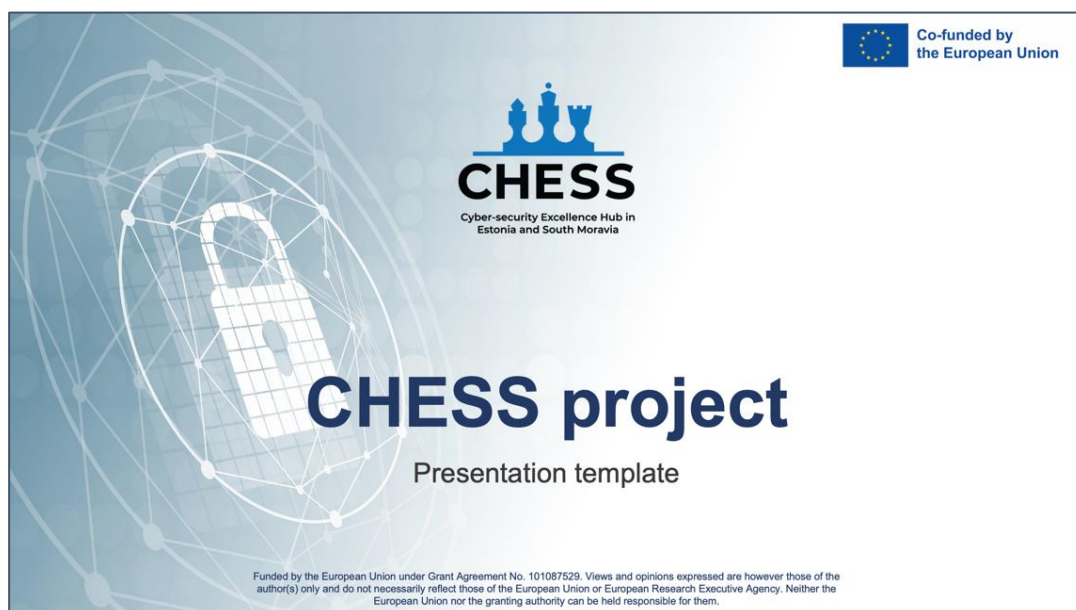
Figure 2: The CHESS Presentation Template