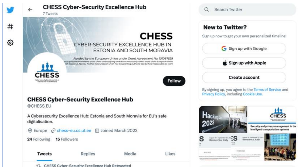
Figure 4: CHESS Twitter Landing Page