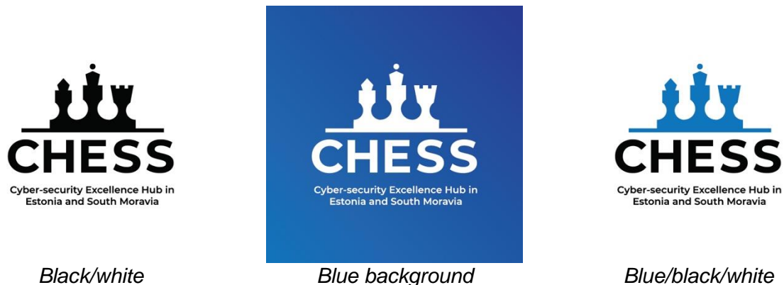
Figure 1: CHESS Project Logo

Figure 1 illustrates the logo of the CHESS project. Different colour schemes can be used/ adapted depending on the partners' preferences. The logo is used in the project presentations (see Figure 2), website, social media channels, deliverables (e.g., this document), brochure, poster, and any other instrument used to communicate CHESS activities, events and results to the target community.